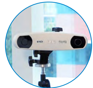
Precise results with high-accuracy IR camera