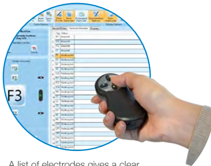
A list of electrodes gives a clear indication of the digitization progress.